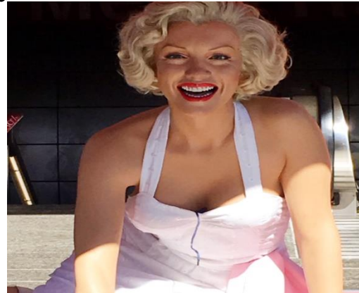
She is out of this world