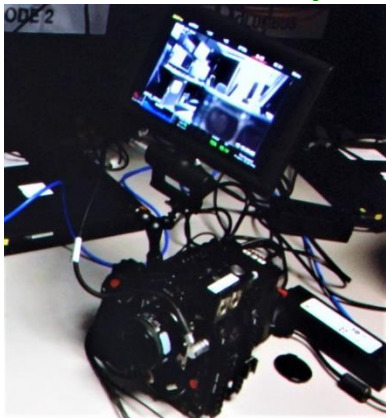
Red Epic Dragon Camera