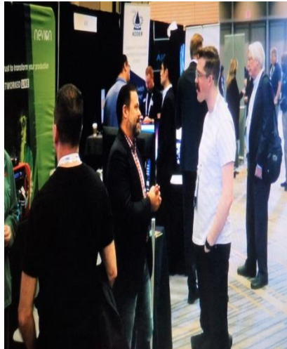
Connecting & Networking