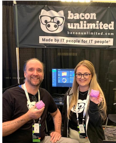
IT & Stress Squeeze