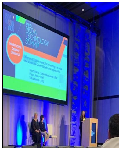
Women of Color in Media