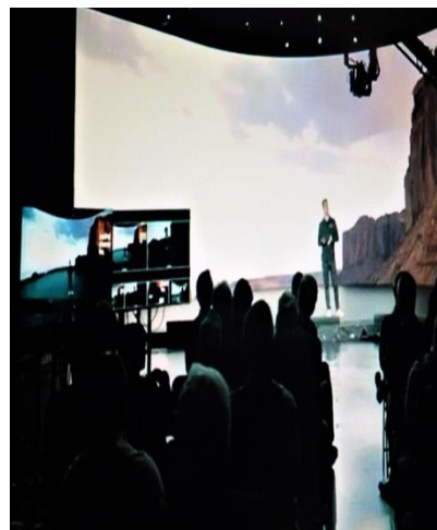
Making Dreams Live