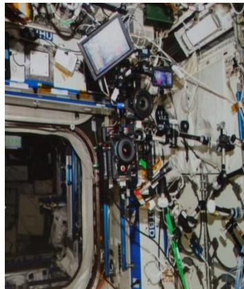
Space Station interior