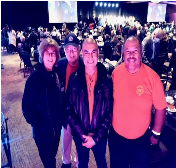
NABET-CWA Local 53 Officers were present