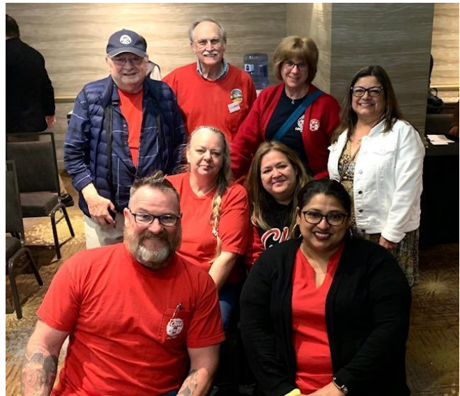
CWA SCC L&P Committee was represented