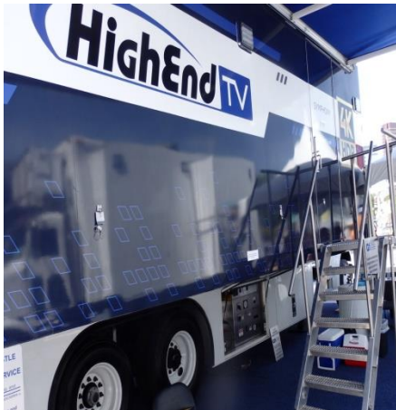
High End TV Remote Field Truck and Production facilities

NAB PREZ and CEO Curtis LeGeyt held a fireside – type chat with FCC Chairwoman Jessica Rosenworcel on the NAB main stage at 10AM April 25 th . The FCC Chairwomen said, “ We’ve got to figure out how to work together or we don’t get anything done.” Regarding initiatives ranging from the CARES Act to the infrastructure investment and JOBS Act, she said, “We’ve turned down the volume and ramped up the activity.” Rosenworcel looks forward to the day when there are 5 commissioners because at present there are only 4 commissioners, creating a gridlock of a 2 to 2 split.