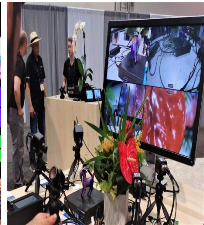
Marshall's Micro cameras