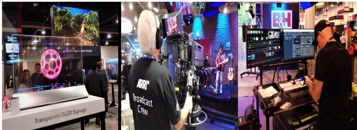
Product of the Year Awarded: ARRI: ARRI Hi-5 camera