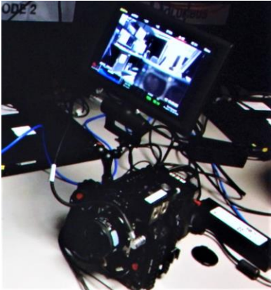
Red Epic Dragon Camera