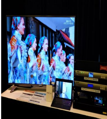
ATSC 3.0 UHD Decoders