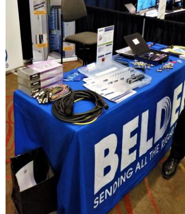
Cables, Tools and Connectors