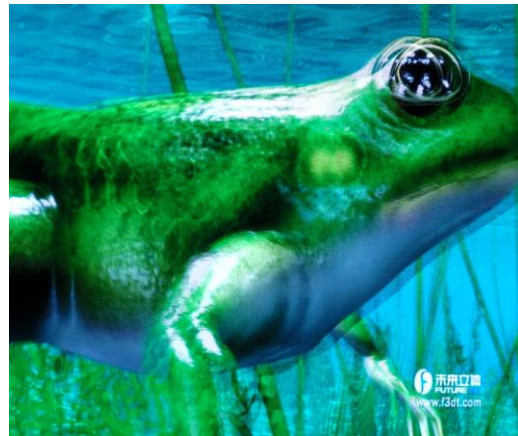
Get your 3D glasses out -- 3D has not gone away