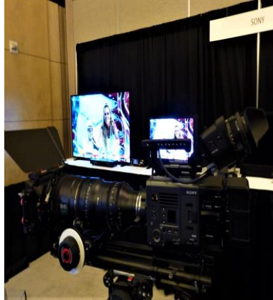
Sony Camera and Monitors