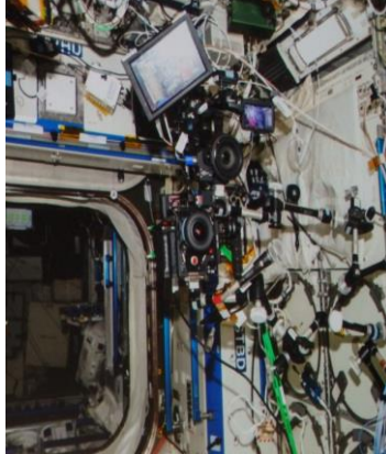
Space Station interior