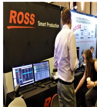
Ross Studio Solutions