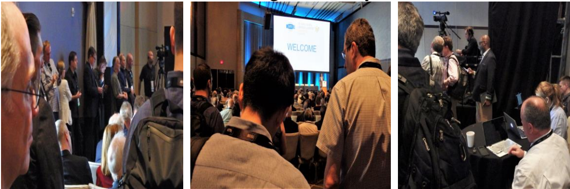
The exhibition had a ways to go, still setting up.