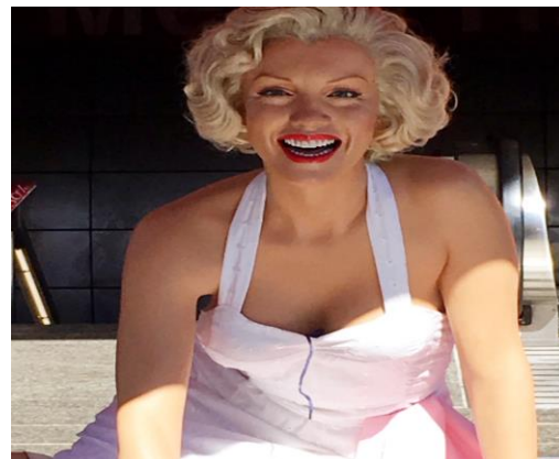
She is out of this world

I found it easier to park my car at the Universal Train Station Parking Lot and then take the Metro (train) to Hollywood and Highland. Arriving at Hollywood and Highland, I was shocked to see the one and only greet me.