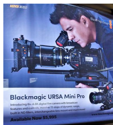
4.0 K Digital Film Camera $5995