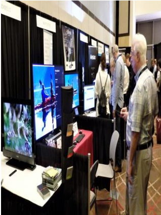
HD and SD Monitors