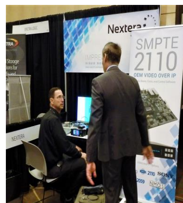
Nextera Video OEM over IP