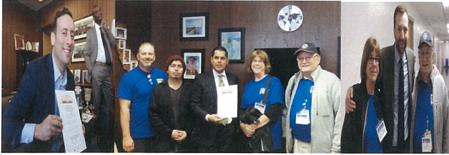
Raise the Wage

Keeping appointments, discussing bills to be sponsored, supported or signed.