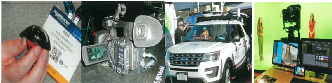
360 Lens for GoPro Canon XF-205 (IR Mode) Dejero Truck Blended Virtual Studio